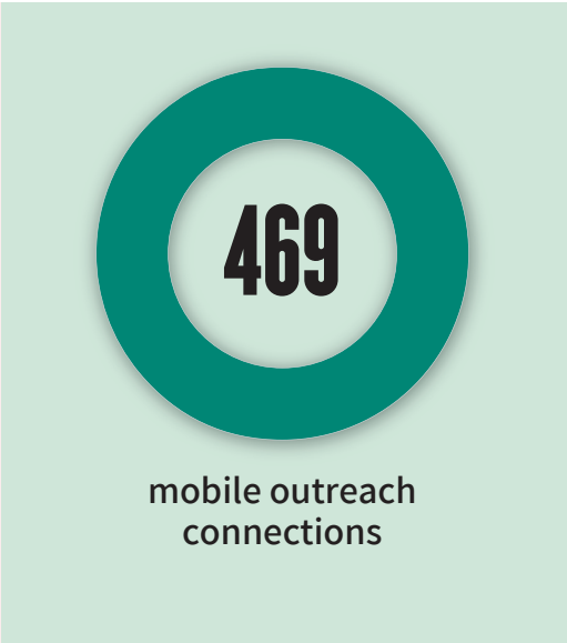
mobile outreach connections