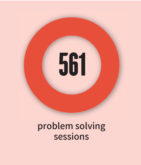
problem solving sessions